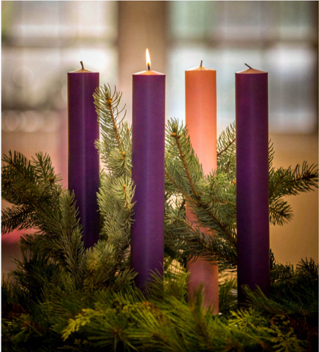
Service begins at 6pm St John the Baptist, Alnmouth All are welcome